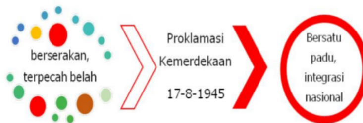
Figure 1: Proclamation of Indonesian Independence is a process of integration of the Indonesian Nation (Team, 2016: 69)